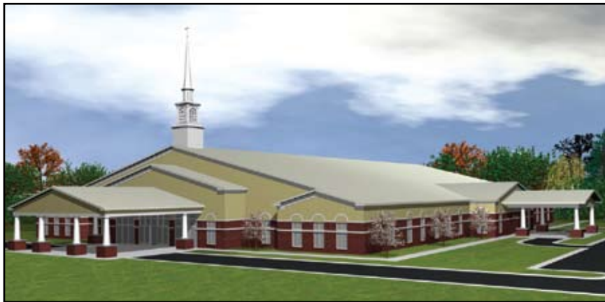
Preliminary rendering of proposed new facility